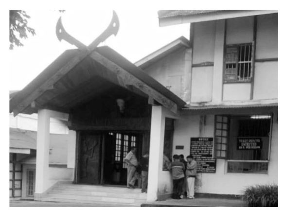
State Museum Nagaland

departmental excavation which are neatly displayed in a small store, Salesian college Dimapur, Anthropology Department, Kohima Science College collections are doing their own, mainly for class room teachings and references. The collections in general are anthropological, ethnological, various art works of brass and wood, related to Christianity, sculptures, world war II collections, replicas of sculptures and few archaeological artifacts. Except the World War II collections, the displays in museum are dress, ornaments, textiles, weapons arms, wooden art works, musical instruments, ceramics, brass works and in some cases diaromas displaying the cultural life of the different communities.