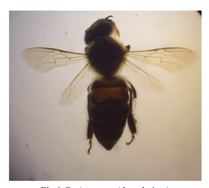
Fig.1.C: A. cerana (dorsal view)