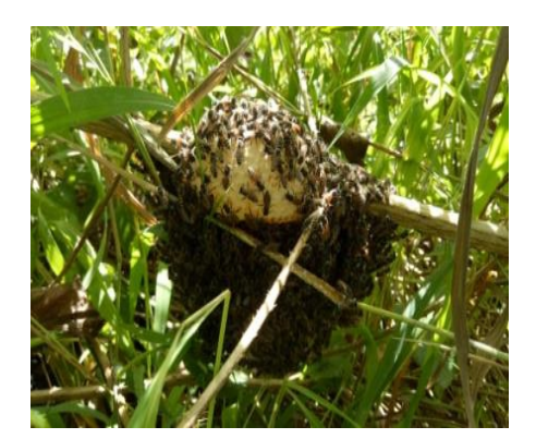
Fig.4: A and B . Two A. florea hives located within a distance of 5 feet at Mercy Bridge Area, Meluri.