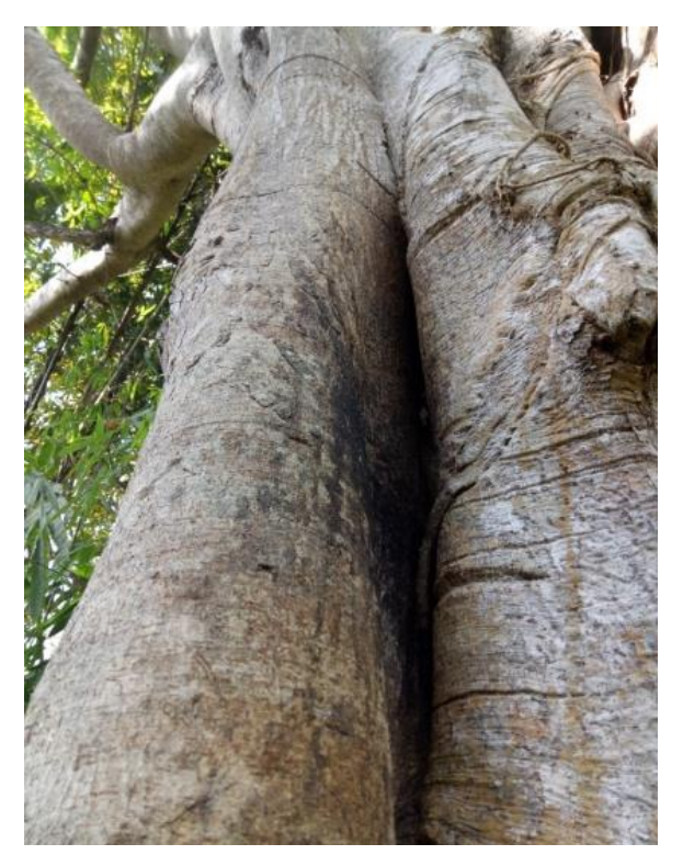
Fig.1.A: Longitudinal entrance of A. cerana hive