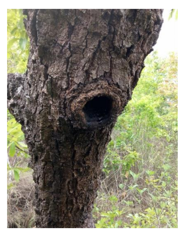
Fig.1.B: Circular entrance of A. cerana hive