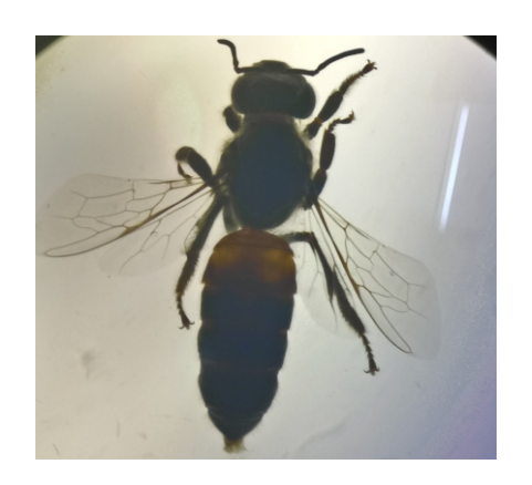
Fig.3.B: florea (dorsal view)