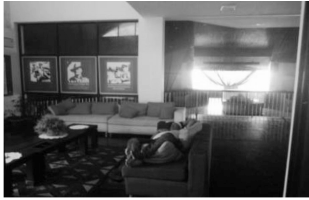
Tribal Museum Longsa village