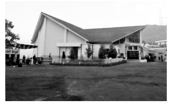
World War II Museum