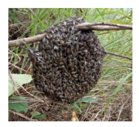
Fig.3.A: florea hive at Kuojile.

single comb was built on the twigs of shrubs camouflaged among the bushes. Most nests of the A. florea were hung from slender branches of trees and shrubs covered with relatively dense foliage. A florea feral nests were sighted on four different altitudinal ranges of the study area i.e., 600 m (at Mercy Bridge), 1036 m (at Kuojile), 1108 m (at Wujile) and 1246 m (at Meluri town) respectively, lying between the coordinates of E094°34.364 Longitude and N25°38.977 Latitude to E094°37.866 Longitude and N25°41.911 Latitude (Fig. 3 A and B, Fig. 4 A and B).