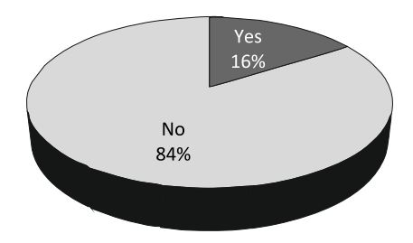
Fig. 1: Percentage distribution of farmers' overall awareness of the inputs

Only 16% of 95 cassava farmers in the four villages surveyed are aware that some farming inputs have been made available by the Nigerian government for them to access and use. 84% are completely not aware. This level of unawareness is recorded despite the presence of various information